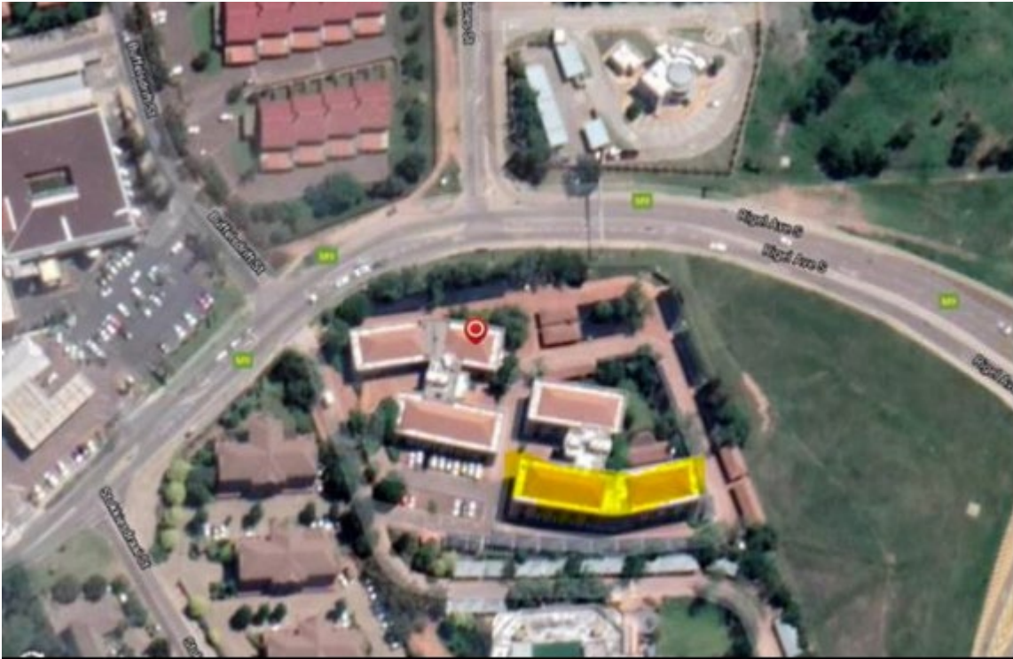
Arial view of new office location (above).