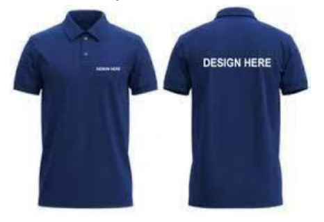
Mentor speed date t-shirts.